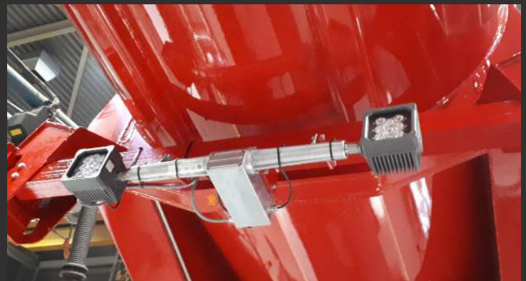
Compatible with many accessories such as this automatic tilting mechanism