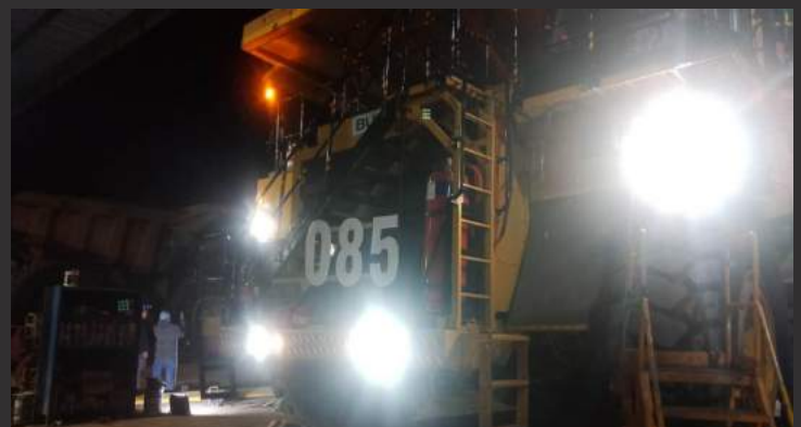
Piranha mounted on a caterpillar deep in Australian mines