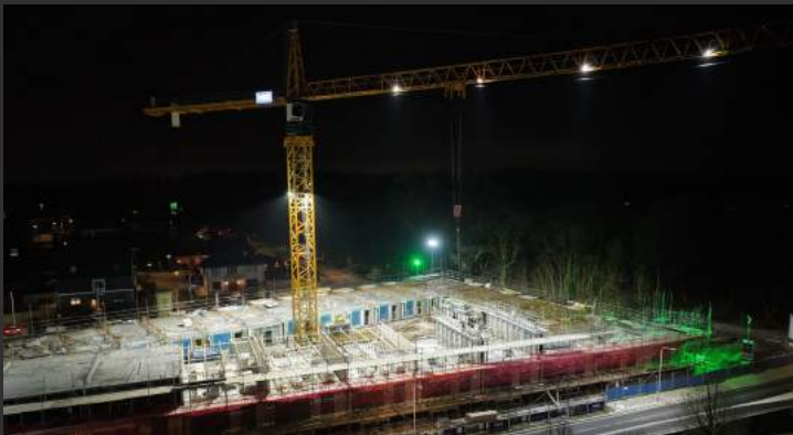
Choosing the right optics ensures proper illumination of important area's

Power : 240W Light output : 47.500 lm Efficiency : 198 lm/W Voltage : 90-305VAC Light angle : 120° (no optics)