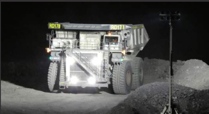
Various light colours allow for a brightly lit working enviroment at night